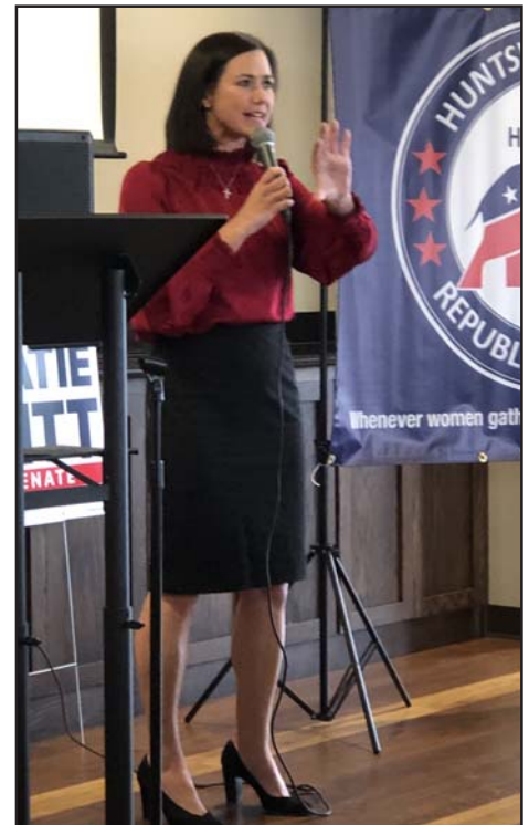
Katie Britt, candidate for U.S. Senate.